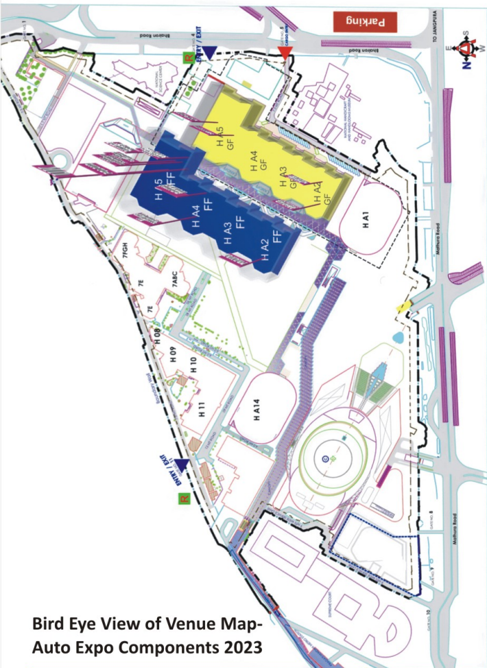
Bird Eye View of Venue Map- Auto Expo Components 2023